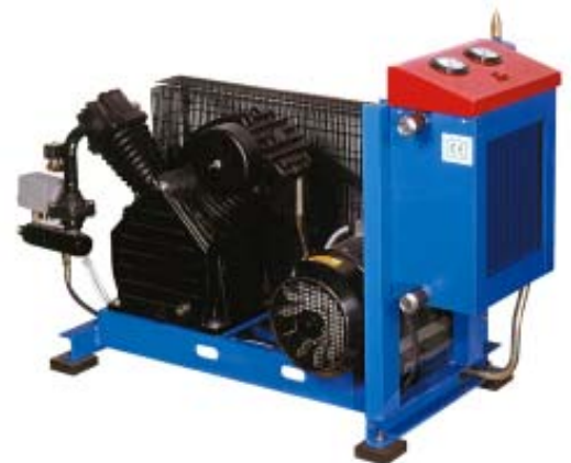
PH units: Lubricated, reciprocating compressors with capacity from 12 to 46 m 3 /h and pressures from 15 to 35 bar.

Equipped with intake and discharge solenoid valve, deadening rubber bearings, aftercooler with package motor fan, condensate separator and drainer, intake and discharge pressure gauge, star-delta starter package, intake pre-filter and non-return valve, the PHB series boosters operate in full autonomy.