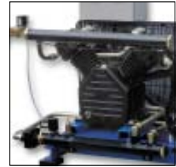
Compressed air intercooler