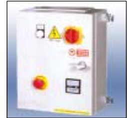
Electric panel with packaged star-delta starter