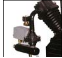
Discharge solenoid valve and pressure gauge